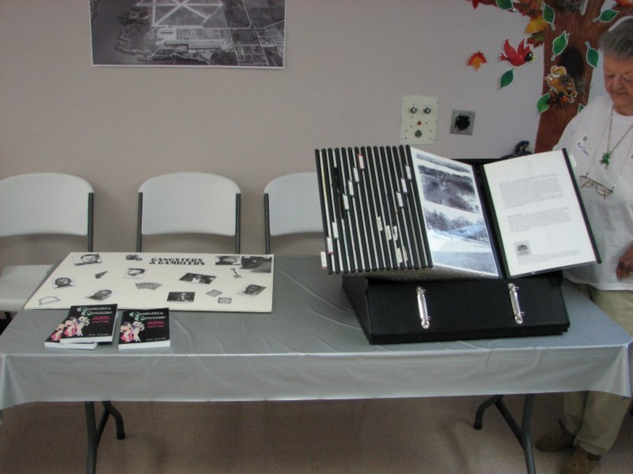
Gangsters and Gamblers