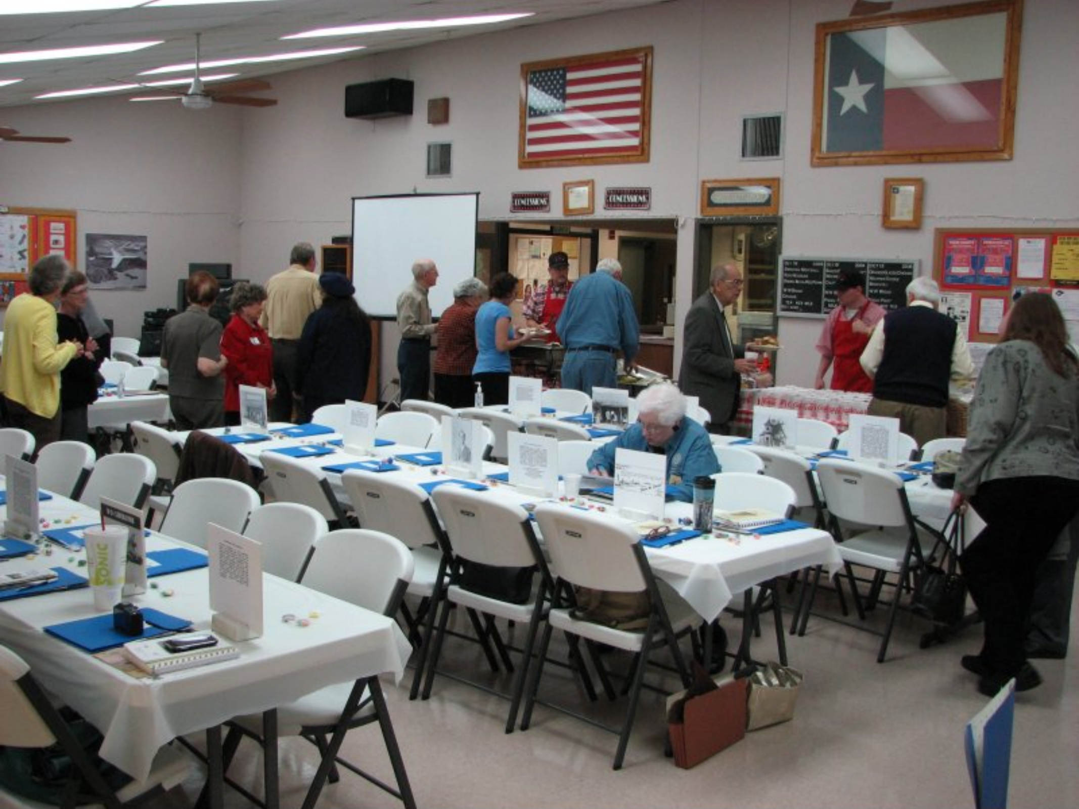
The Front Room