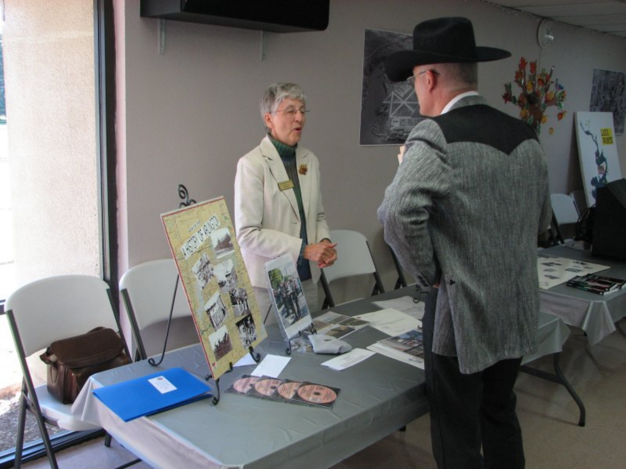
A History of Arlington