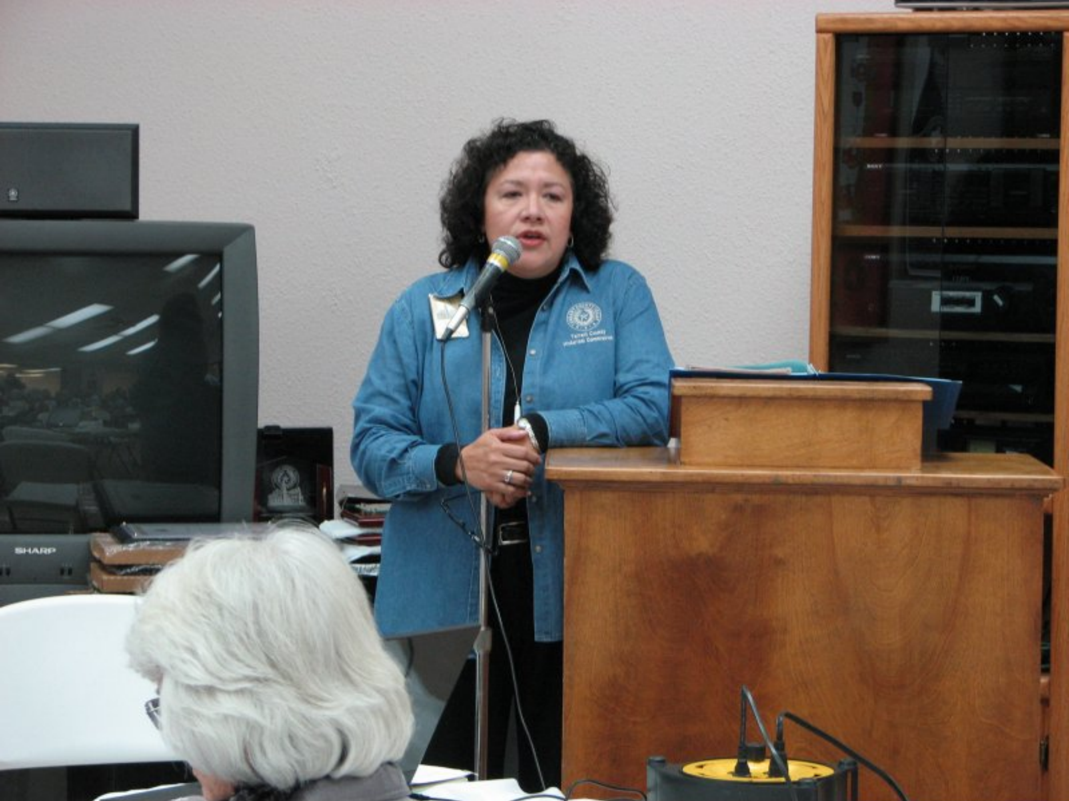
Our Master of Ceremony