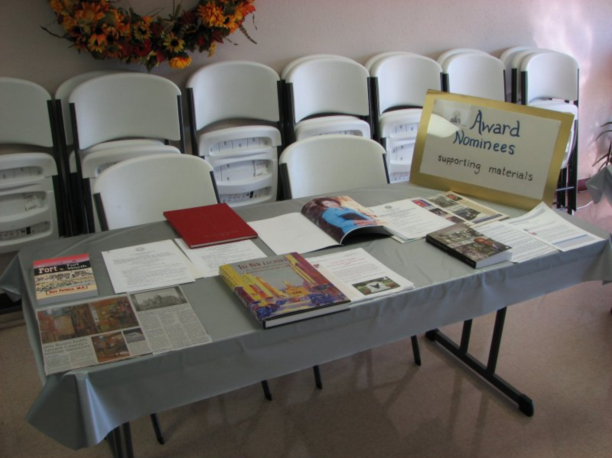
Supporting materials for award nominations