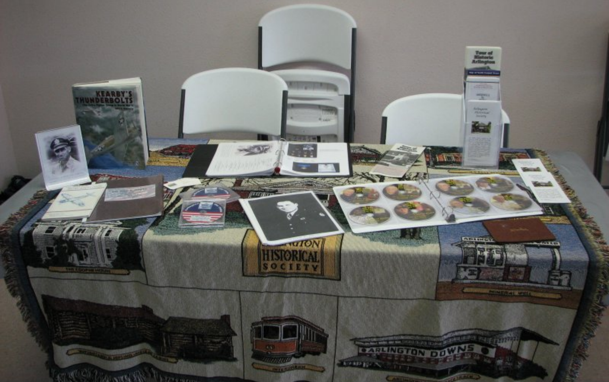
Arlington Historical Society