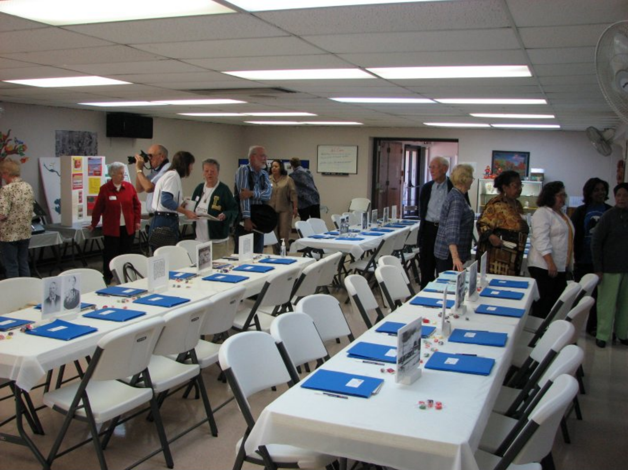
The Back Room