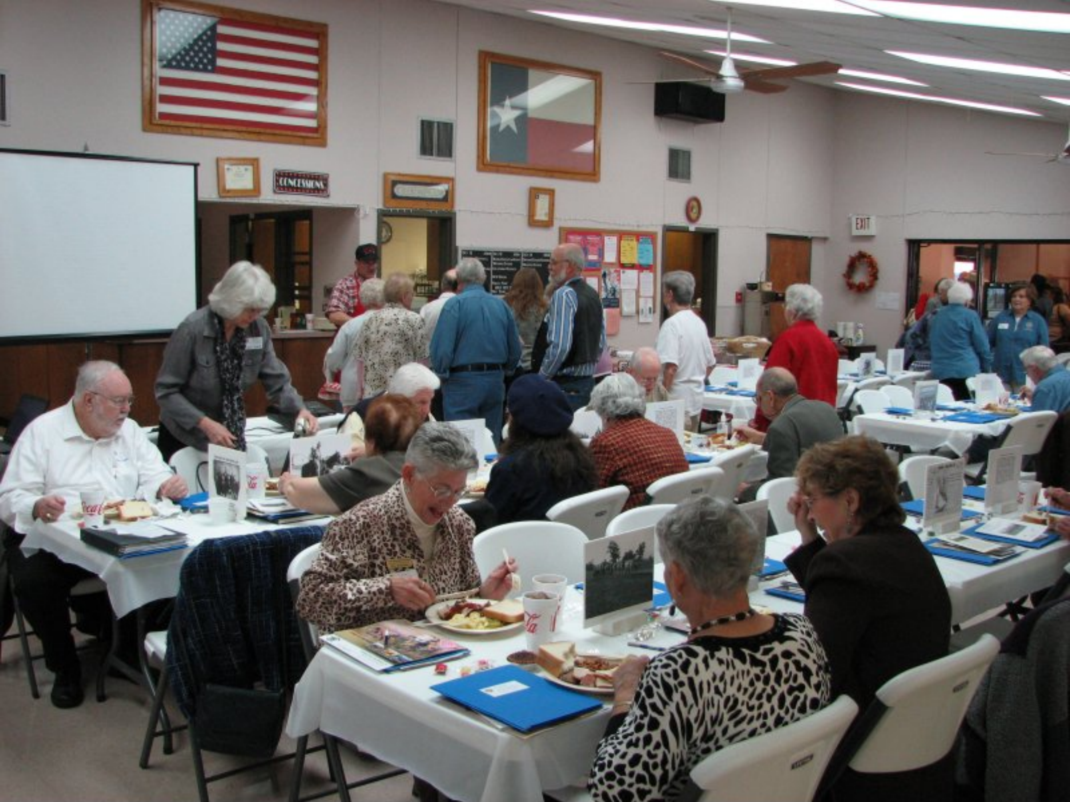
Dig in folks. Lunch is catered by Soda Springs Bar-B-Q.