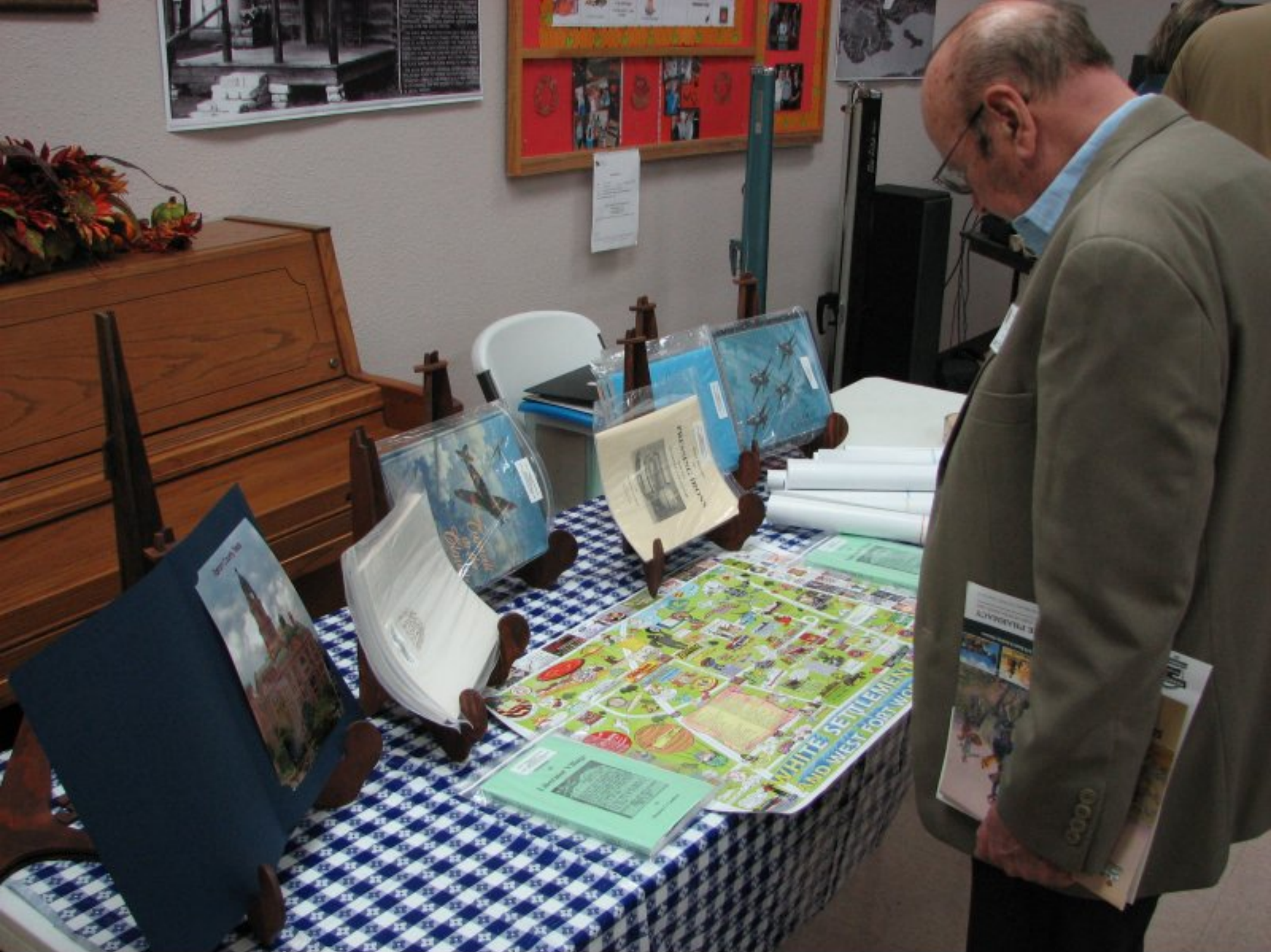
The Door Prize Table