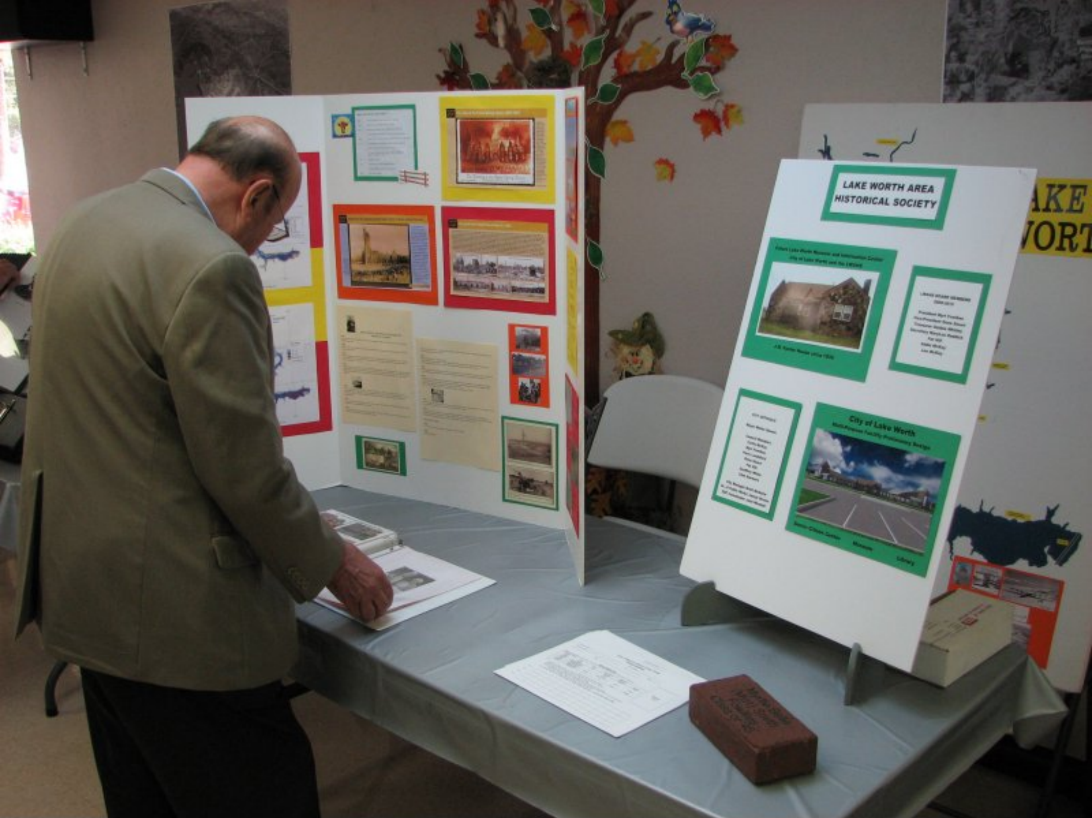
Lake Worth Area Historical Society