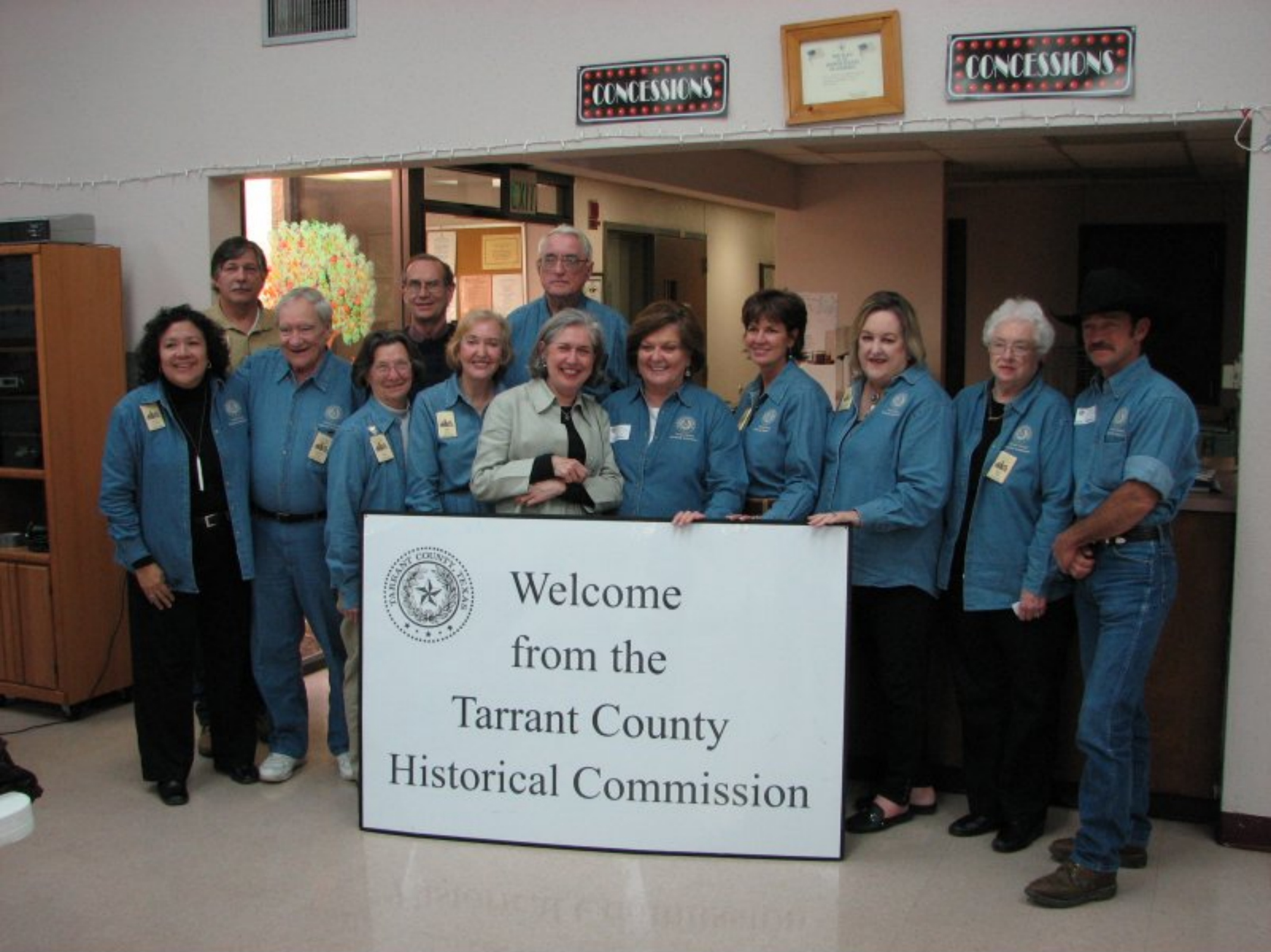
Members of the Tarrant County Historical Commission