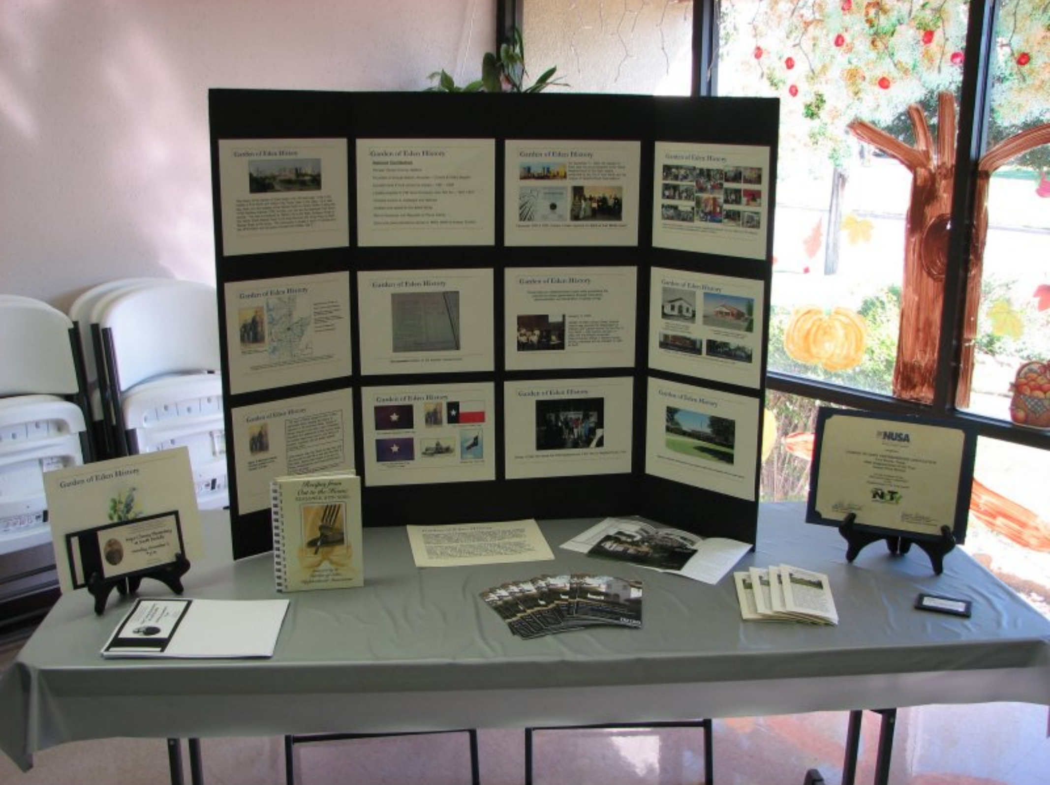
Garden of Eden Neighborhood Association