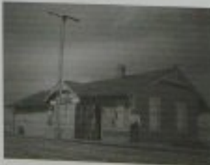
Hurst Train Depot

In 1905, the Rock Island Railroad approached William Letchworth Hurst, better known as "Uncle Billy", about laying track across a strip of land he owned for a line between Fort Worth and Dallas. In return for the right-of-way across the Hurst farm, the Rock Island Railroad agreed to build a depot and station in Hurst. At its peak, the Depot served as a telegraph station, had an area for loading, cattle pens, and warehouses. In 1908, there were six trains that ran through Hurst from Dallas and Fort Worth. The Depot was located at the southeast corner of the tracks and present day Harmon Street but at the time extended to the tracks. It is located about one-half mile west of the Historical Plaque at the Hurst RR Station. Today, the Kelly-Morse Paper Company owns the land and the Trinity Railway Express passes the site of the original Hurst Train Depot. Although the original site is no longer accessible to the public, this plaque is a fitting reminder of an important event in that by of Hurst's history.